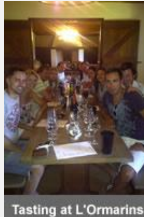
Tasting at L'Ormarins